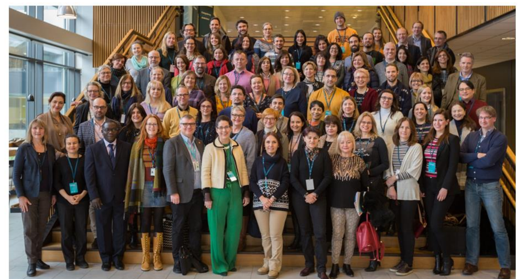
EVBRES participants at the first Workshop meeting in Bergen, Norway, February 2019